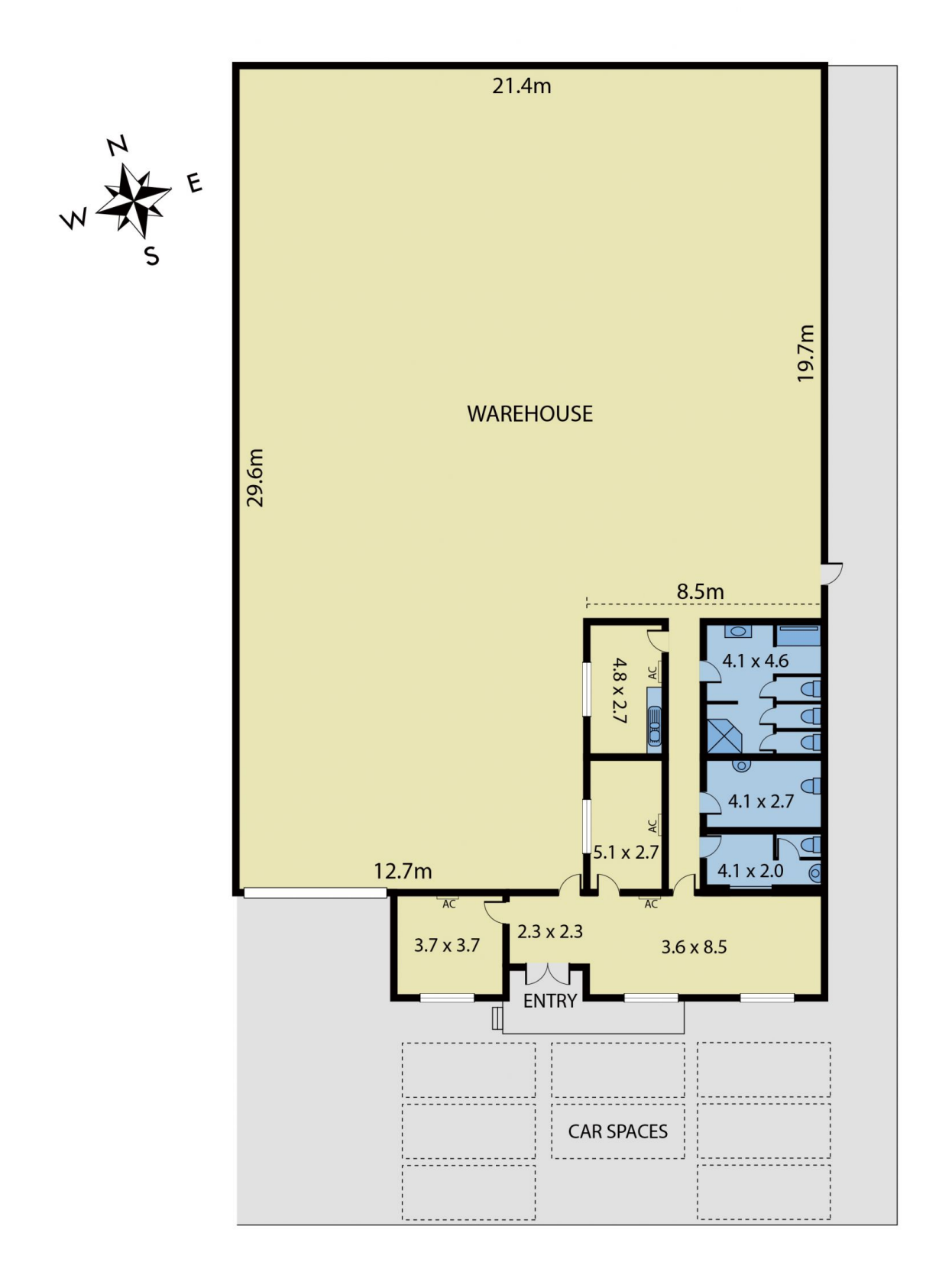
Disclaimer: Whilst we believe the contents of this document to be accurate, we suggest the prospective purchasers make any necessary enquiries to satisfy themselves. We do not accept responsibility for any errors or omissions.